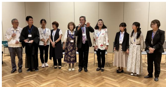
Kawagoe Club Participants