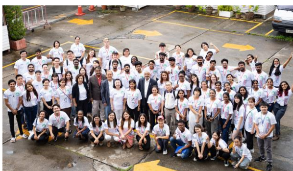
Group photo from the year before last